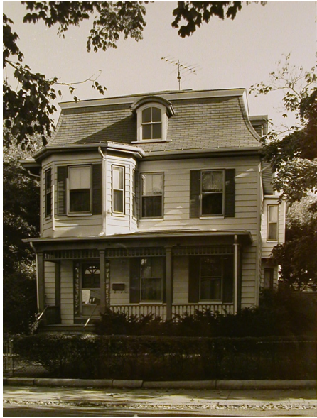
Tip O'Neill's House, 1868

The physical fabric of Orchard Street features a cohesive collection of well-preserved mid-nineteenth century buildings. Examples of the Italianate, Queen Anne, and Colonial Revival building styles can all be viewed here. Notably, Thomas P. (Tip) O'Neill, Jr., former Speaker of the U.S. House of Representatives, grew up at 26 Russell Street, on the corner of Orchard Street.