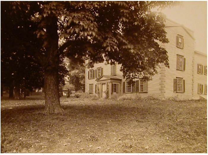
Period photograph of Hooper-Lee-Nichols House

When a streetcar company wanted to improve its service by electrifying its tracks on Brattle Street in 1890, the residents again exercised their power and forced the company to abandon the line and build tracks elsewhere. Mount Auburn Street and the newly laid-out Huron Avenue instead became streetcar routes, and the Huron Avenue area became Cambridge's "streetcar suburb."