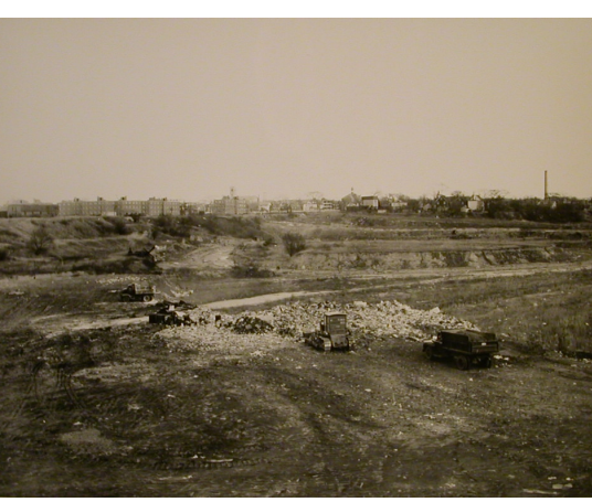
Site of Danehy Park, 1951

Danehy Park was originally one of Cambridge's many clay pits which were later used as trash dumps, then filled over and made into parks in recent years. By the 1950s, the pits where Danehy Park now sits were dug to about 30 feet deep. But the business was increasingly less profitable. In 1952, one of the clay faces collapsed, burying a steam shovel and killing the driver. The business closed and the city used the pits to dump garbage, which eventually mounded to 30 feet above ground level. The trash repeatedly caught (or was set) on fire, producing polluting smoke and awful smells until dumping ceased in 1971.