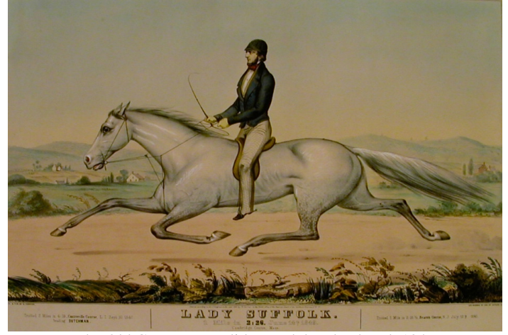
The Old Grey Mare -- lithograph hand colored, 1849

From 1837 to 1855, the area bounded by Rindge, Jackson, Harvey and Cedar Streets was the Cambridge Park trotting course, a horse racing course. The affiliated Park House Hotel was built facing the race track and adjacent to the grandstand in 1847 and today survives as the 20-unit apartment building at 39 Cedar St.